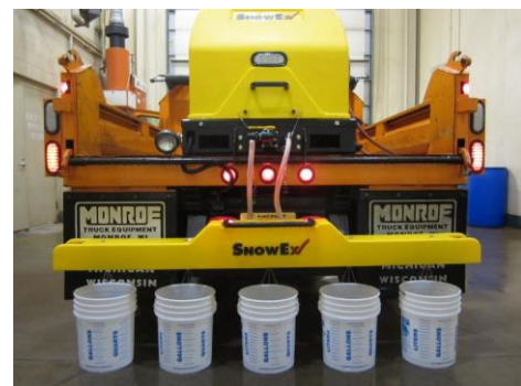
Individual catch test buckets give nozzle discharge plus total discharge

In addition to catch tests, applying a test pattern gives easy insight into nozzle problems.