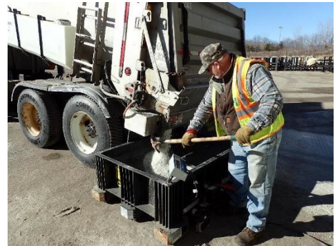
Above, an operator is performing a catch test with a scale box.

Ground speed controls are more accurate and require less time calibrating than manual controls. Run the spreader for one minute and weigh the material that comes out. This is called a catch test. Only one setting needs to be calibrated for each type of material that will be applied. Enter the data from the catch test into the computer. The system will take care of the rest. Since each computer-controlled system has a unique calibration mode, check with your vendor for specific calibration instructions.