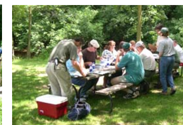
Discussion of monitoring procedures at Apple Creek during the 2004 Teacher Training Workshop