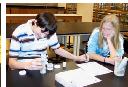
Students performing conductivity tests during the "Procedure Challenge" at the 2004 Annual Watershed Symposium