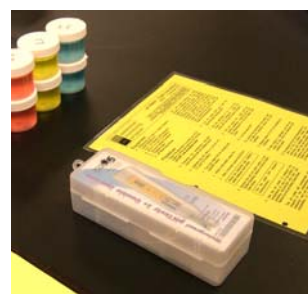
Equipment and field procedure sheet for sampling stream pH