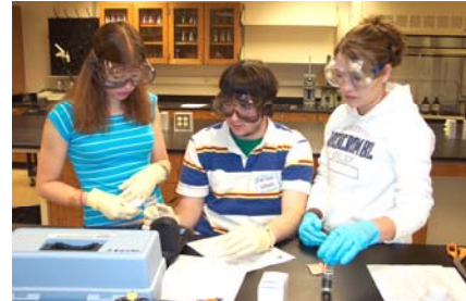
Students performing nutrient tests during the "Procedure Challenge" at the 2004 Annual Watershed Symposium