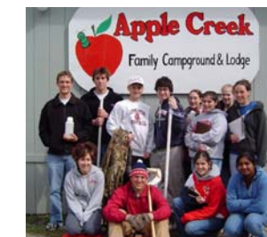
Appleton East team at the Apple Creek Campground sampling location, May 2004