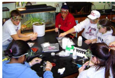
Appleton East students performing nutrient analyses on water samples from Apple Creek