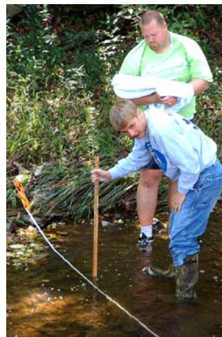
Student-Teacher team collecting streamflow measurements at Apple Creek