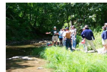
Sampling procedures practice at Baird Creek during the 2003 Teacher Training Workshop