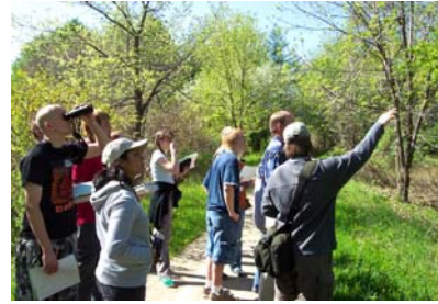
Practicing bird counts at the First Annual Student Watershed Symposium, May 2004

Major funding for the program is through a four year grant from Arjo Wiggins Appleton, Inc.