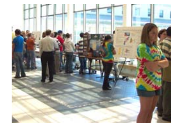
Students, teachers, researchers, and community members discuss findings at the poster session