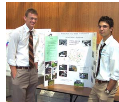
Students from Markesan High School exhibit their poster during the 2004 Student Watershed Symposium