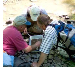
Teachers sorting macroinvertebrate samples during training exercises