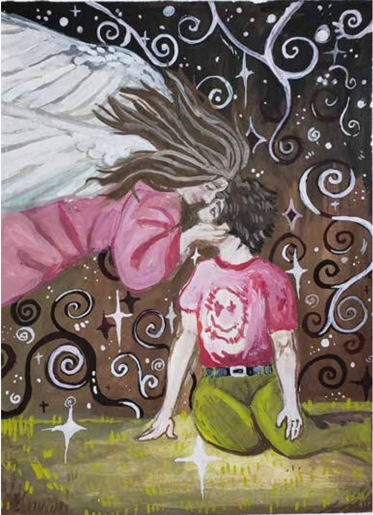
art by Eddy Laning