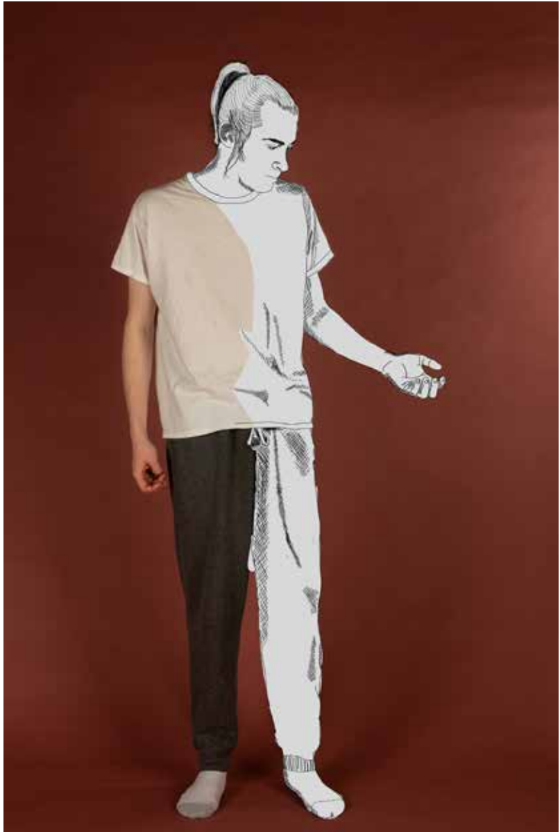
“Still a Sketch” by Noah Purzycki