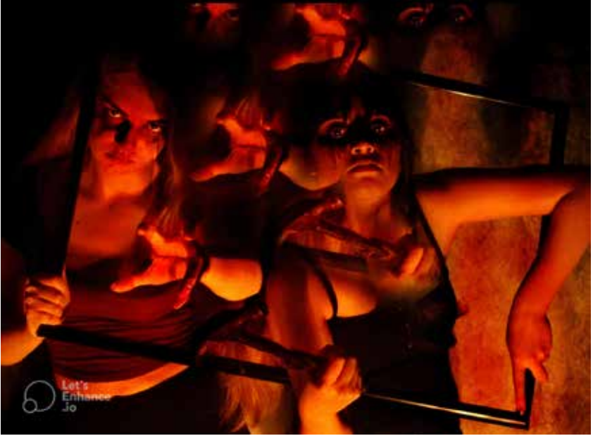
“Out of Frame” by Jasmine Puls