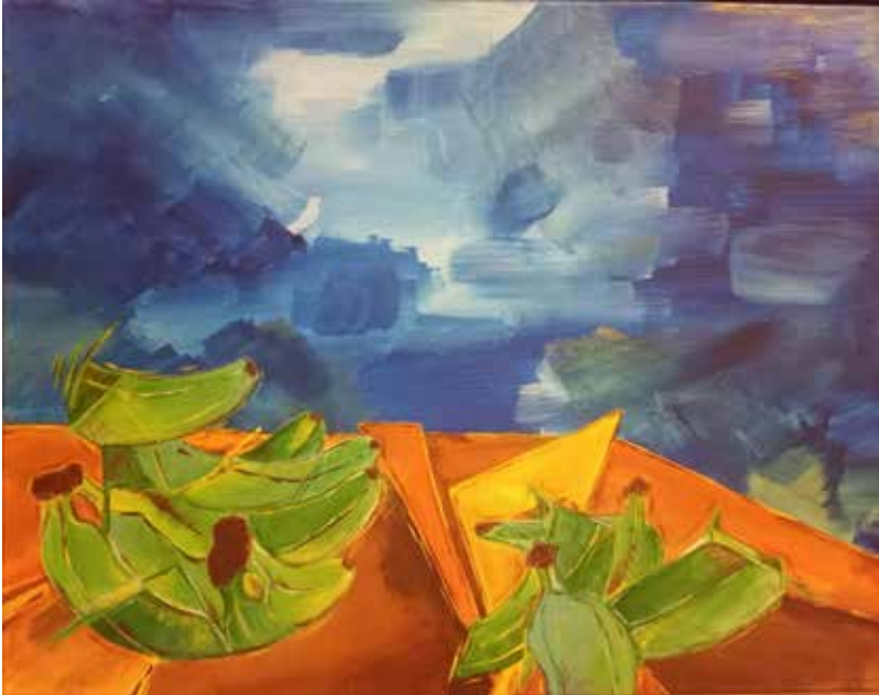
untitled by Leovardo Aguilar