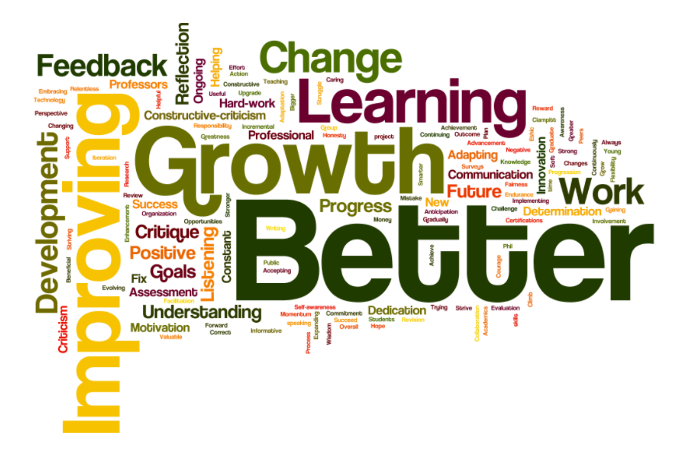
Figure 1 Top Three Words that Continuous Improvement (CI) Brings to Mind