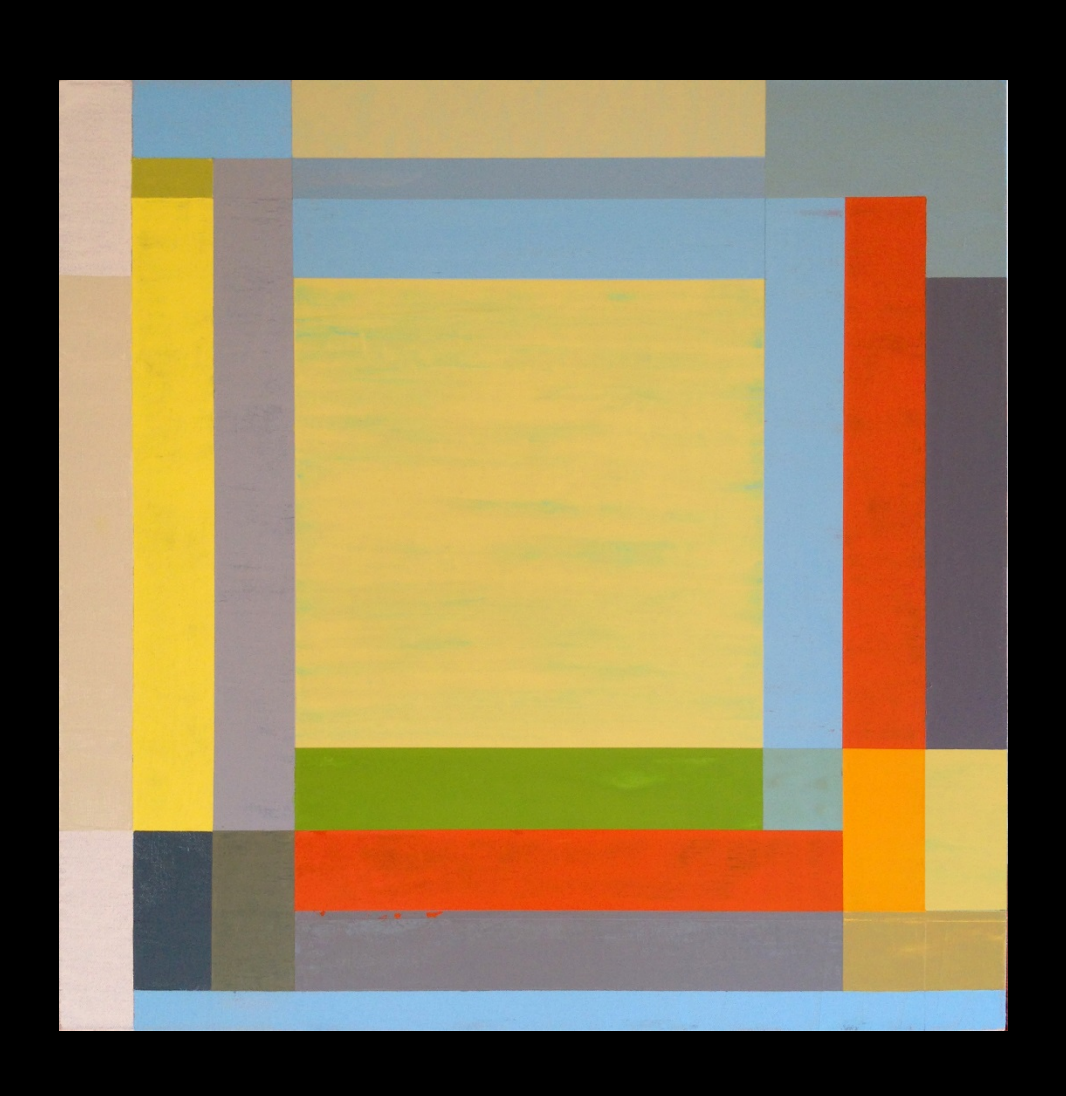
Color Dynamics Structure no. 1 oil on canvas, 24"x 24", January 2019