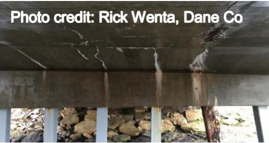
Rusting and concrete damage caused by corrosion from chlorides