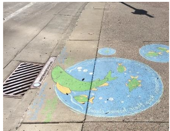
Water and pollutants that enter storm drains go into the nearest surface water.

Water in urban areas is more at risk of chloride pollution from winter maintenance.<sup>2,3</sup> In urban areas, water drains from impervious surfaces, which includes roads and parking lots, through storm drains. In places that have separate stormwater and sanitary sewer systems, storm drains transport water to a lake, river or stream. This water is not sent to a treatment plant first, which means that chlorides and any other pollutants in the stormwater runoff end up in local waterways. Even in areas with combined sewer systems, many treatment plants are not able to remove chloride from the water without costly upgrades to their facilities.