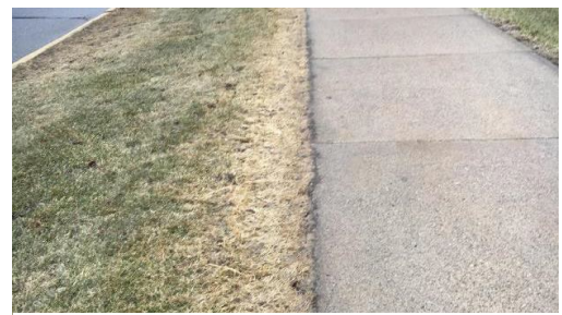
An example of dead turf grass next to the sidewalk caused by chloride

When rock salt gets into soils near roads and sidewalks, sodium can alter the soil chemistry and structure. The altered structure leads to poor drainage and compaction.<sup>13</sup> Sodium can also make soil more alkaline, which can reduce available nutrients important to vegetative growth.<sup>13</sup> Salt may also kill soil bacteria, which can increase erosion.<sup>19</sup>