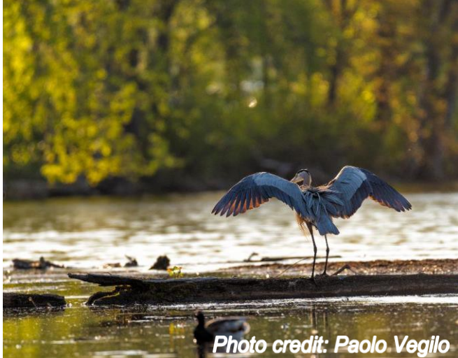
You have the power to reduce the effects of winter maintenance pollution on our water.

In rural areas, water drains through networks of drainage tiles and ditches. Rural areas have less roads, sidewalks and other impervious surfaces, which relates to less chloride pollution from winter maintenance in surface waters.<sup>2,3</sup>