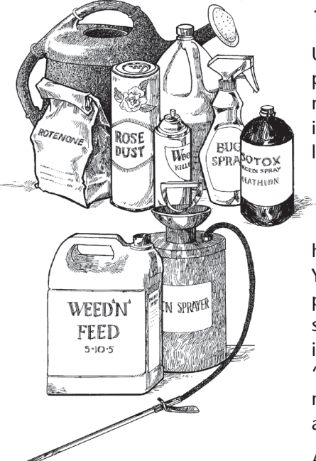
Before using lawn and garden pesticides, know the plants, their pests and the chemicals you plan to use.

Safe and reliable chemical treatment of some yard care problems is definitely possible for the informed homeowner. The key is to know plants, their pests and the chemicals you plan to use. Rather than attempting to tackle a problem you are not prepared for, it is always better to seek professional assistance and consider more natural alternatives whenever possible.