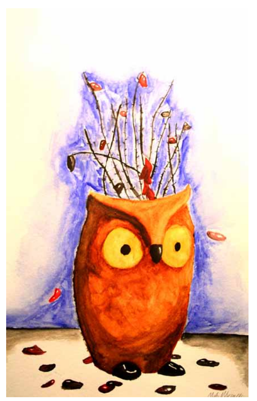
OWL by Nikolaus Wrench