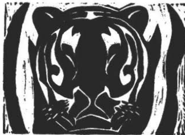
Jungle Lion by Nikki Cairns

The coyote sat happily scratching away at its side, oblivious to me sitting in the tree almost directly above it. Suddenly it stood up and looked intently at the ground before it. It swatted playfully at the ground with its tawny front paws and finally pinned something to the ground. It reached down with its mouth to where its front paws were held firmly to the ground, and I could see that it had a squeaking field mouse trying desperately to get back to its safe home. The coyote snatched it in its teeth, gave it a playful flip in the air, and then deftly snapped it back into its mouth.