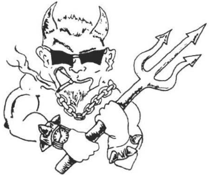
Chillin by Tim Thieme

I'm a fallen leaf - green at heart, a flash of color, and a bit faded around the edges.