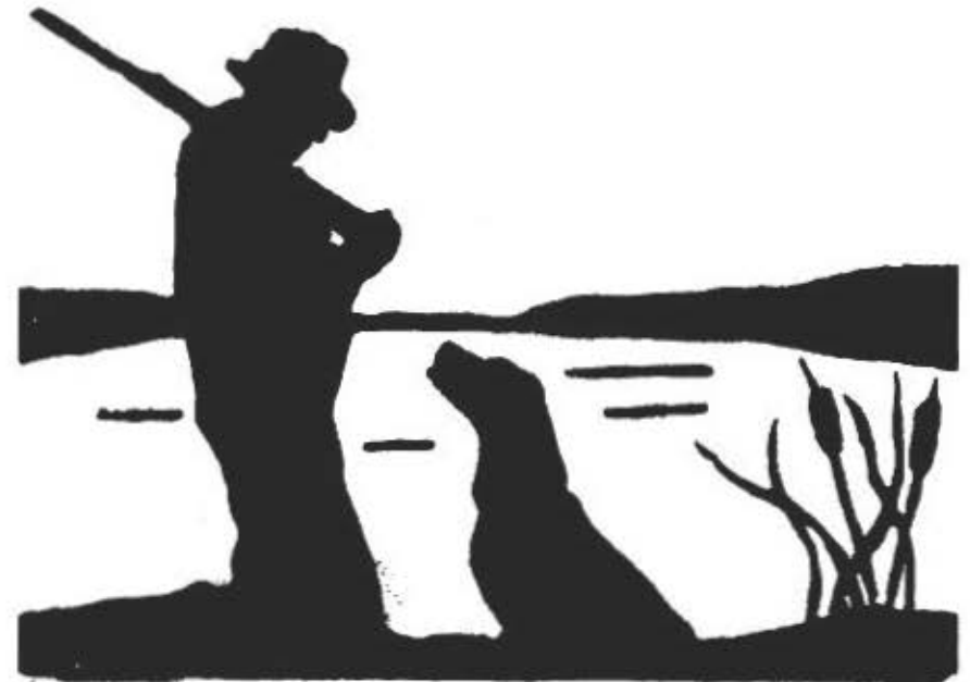
Relaxing with a Friend by Tim Thieme

With these advantages in mind, it is wise to consider the addition of the family dog to one's accumulation of modern, labor-saving and beneficial machines.