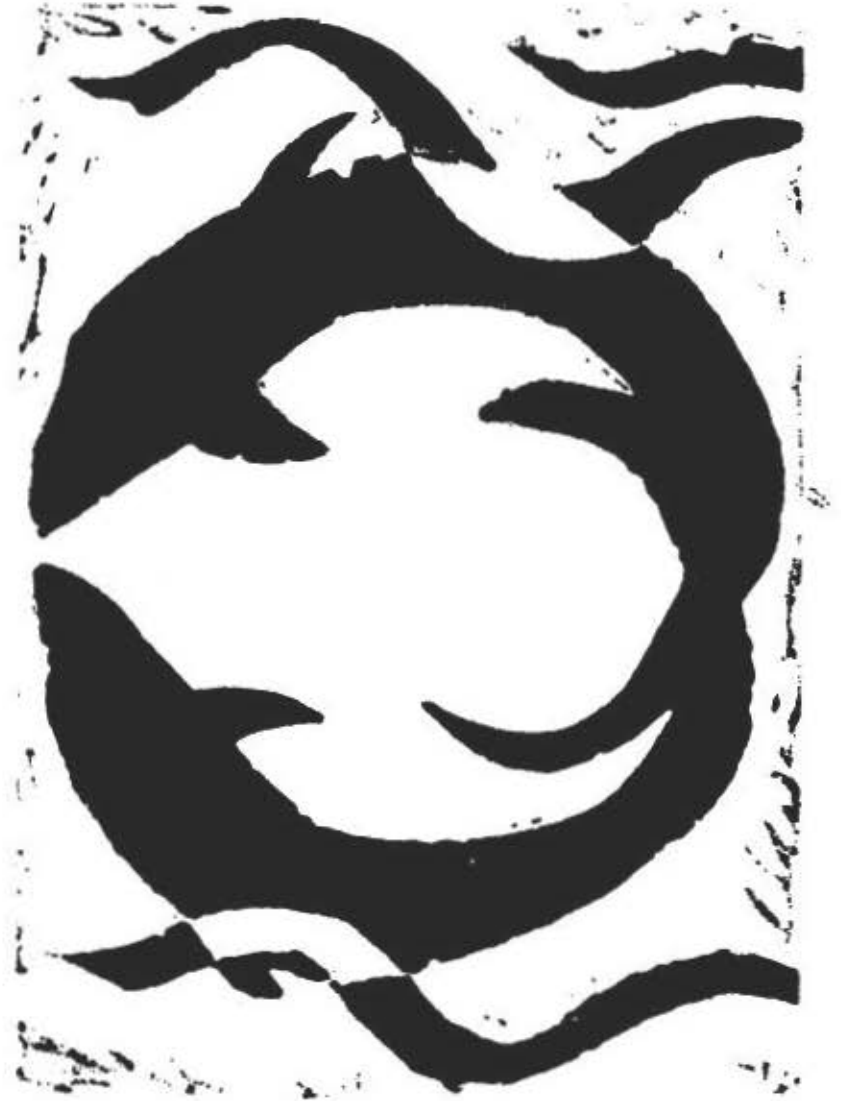
Dolphins by Dena Osting