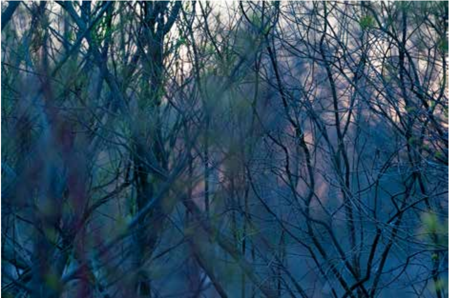
“Dawn” by Collette Larue