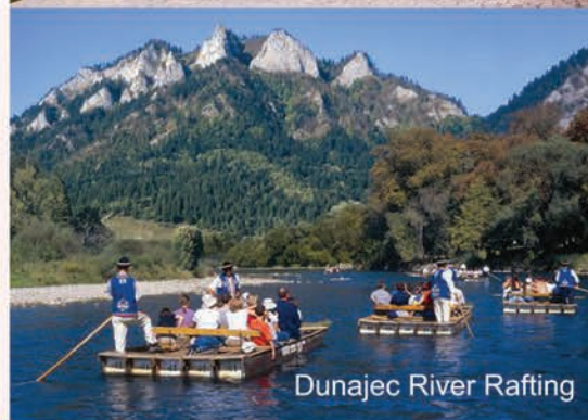
Dunajec River Rafting