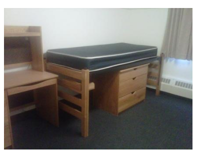
Figure 1: Junior Lofted Bed (Standard set-up prior to arrival)

All apartments and residence hall bedrooms are furnished with a desk, dresser, and adjustable bed for each student. The junior loft bed configuration is the most popular and space efficient set-up, allowing the dresser and other items to be stored under your bed. If you prefer this option, and most students do, no action on your part is necessary.