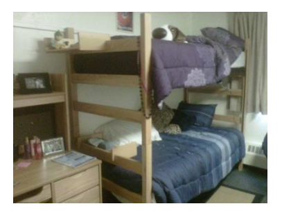
Figure 3: Bunked Beds

Some students prefer having their beds bunked. You can make this modification on your own with the assistance of a helper*.