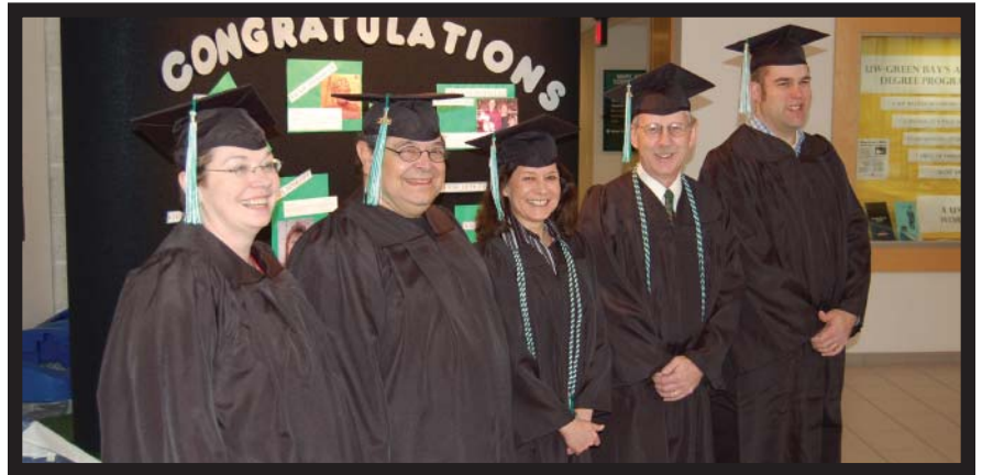
Graduates attending the Cap and Gown Reception smile for the camera