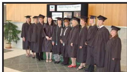
Grads at the Cap and Gown Reception