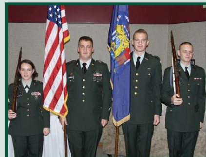
UW-Green Bay & St. Norbert College Color Guard

UW-Green Bay will have an unduplicated count of about 300 students (about 5 percent of total enrollment) receiving veterans benefits this coming fall. Of those, about 230 will be veterans and about 70 will be dependents of disabled veterans.