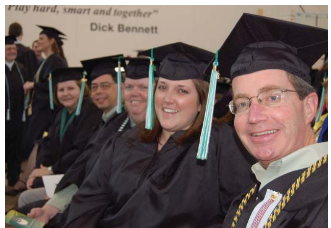
Soon-to-be ADP grads wait for commencement.