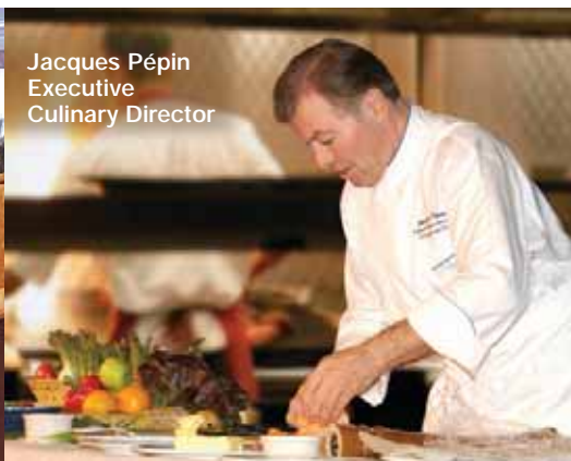
Jacques Pépin Executive Culinary Director