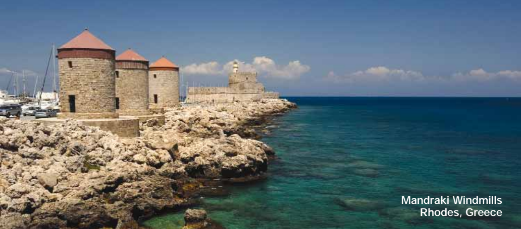
Mandraki Windmills Rhodes, Greece