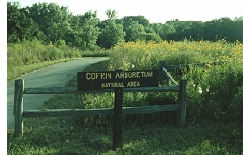
Figure 3. Trail entrance: The Cofrin Center for Biodiversity