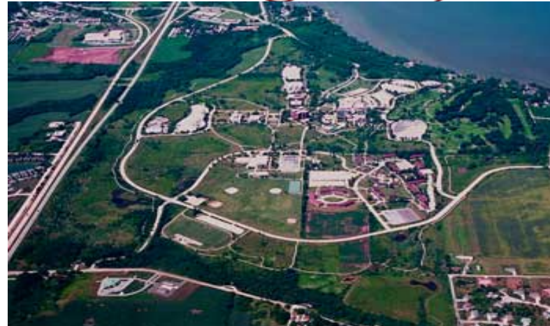
Figure 1. Campus aerial photo: The Cofrin Center for Biodiversity