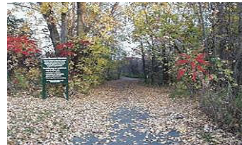
Figure 4. Trail entrance: The Cofrin Center for Biodiversity