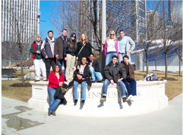
International Club members on the spring break, March 2007 .

Phone: 920-465-2190 Fax: 920-465-2949 E-mail: oie@uwgb.edu