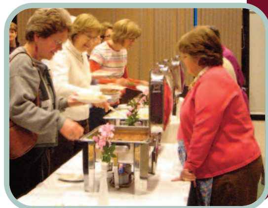
Attendees to "Specialties of the Lord's House" help themselves to baklava and other samples.