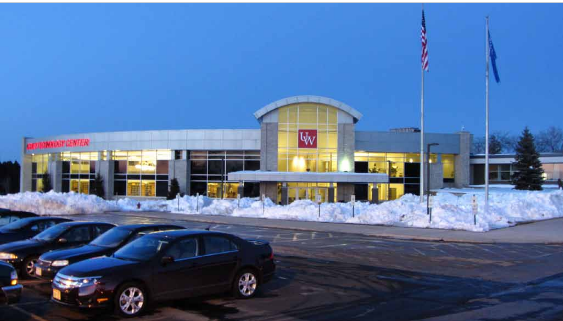
Snow surrounds the Acuity Technology Center.