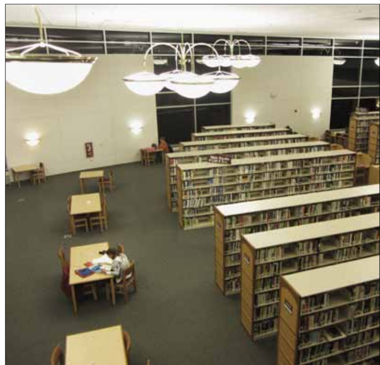
The library offers even fewer distractions at night.