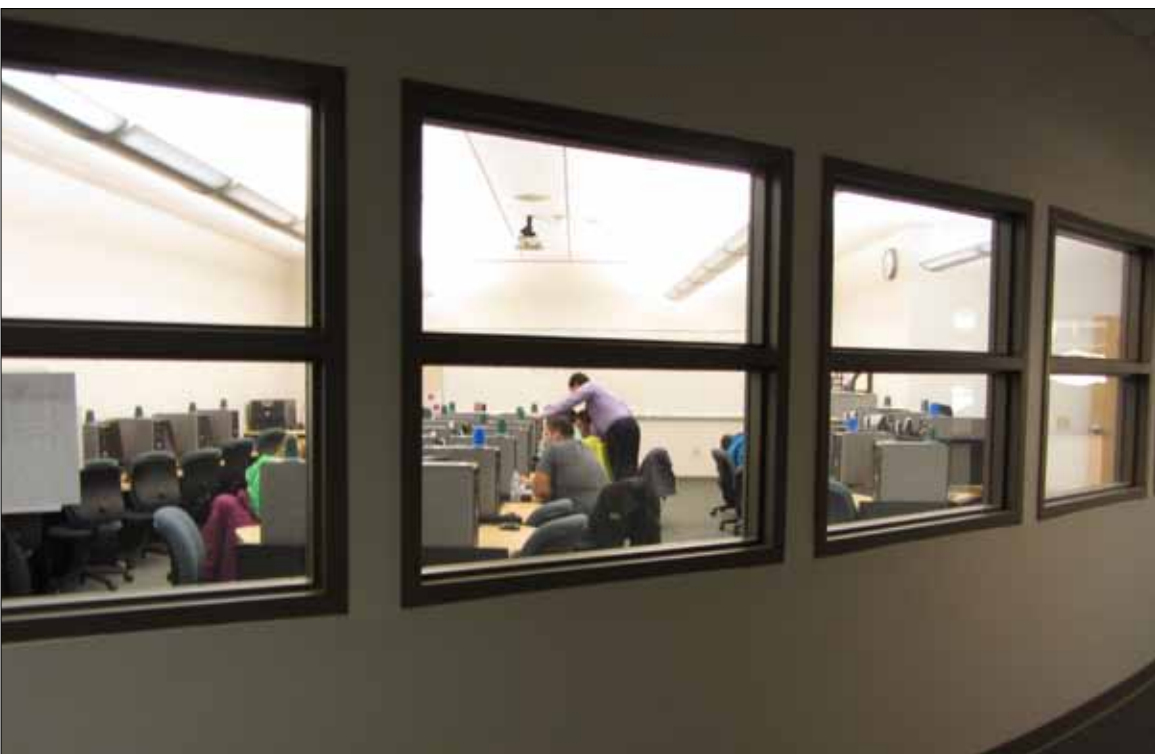
Robin Starck teaches an evening algebra class.