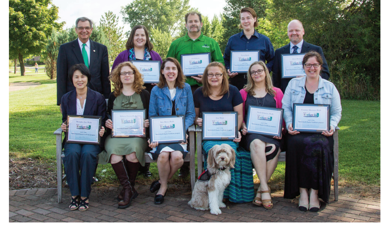
Inclusivity and Equity Certificates awarded in August 2017

The Chancellor's Council on Diversity and Inclusive Excellence offers a certificate program which is designed to develop and recognize commitment to the UW-Green Bay Inclusive Excellence initiative. This certificate program consists of a combination of professional development, self-study and community service. It is open to UW-Green Bay students, faculty and staff.