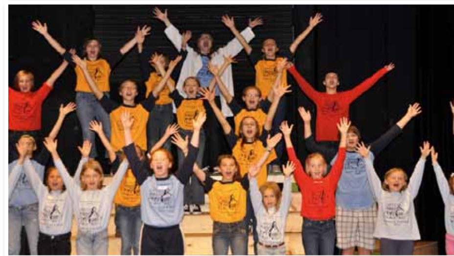
Members of the Schoolhouse Rock Live, Jr. cast perform a scene from the play, October 2013.

UW-Marquette's Office of Continuing Education served nearly 3,400 people in our community last year. Most notably, the Children's Theatre performances for school groups grew from one day to four with Schoolhouse Rock Live, Jr. which had a record number of over 1,200 local students and teachers in attendance, some from as far away as Coleman and Stephenson, MI.