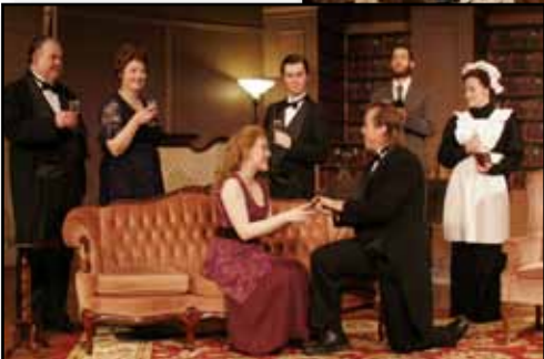
An Inspector Calls