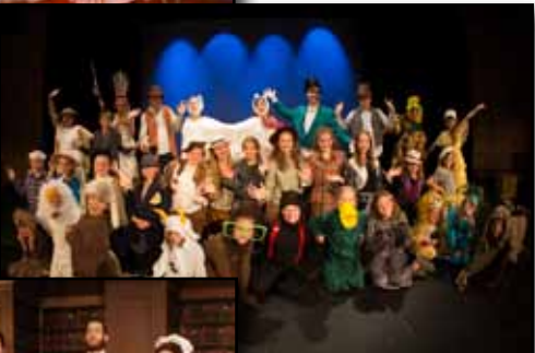
Doctor Dolittle, Jr.