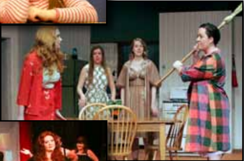
Crimes of the Heart