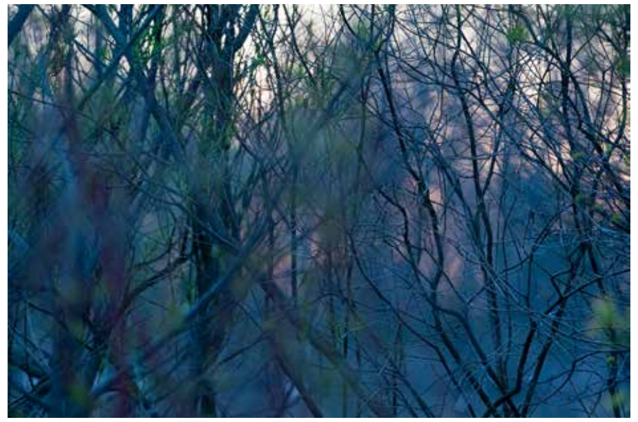
"Dawn" by Collette Larue