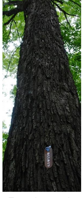
Tagged tree at the Wabikon Forest Dynamics Plot.