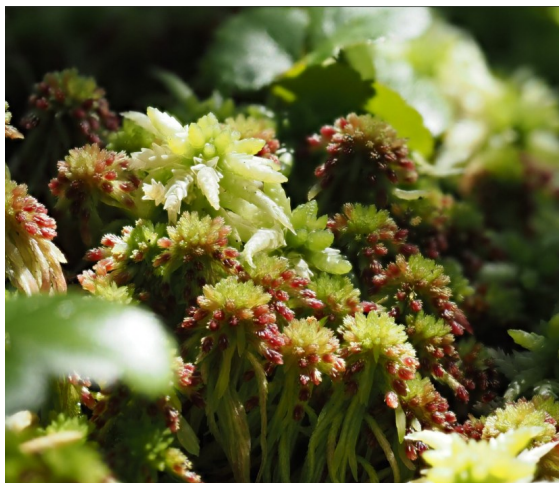
Sphagnum centrale Sphagnum capillifolium