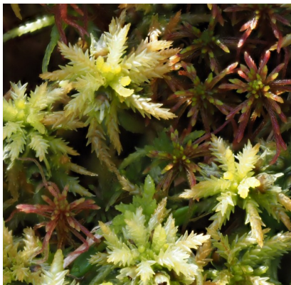
Sphagnum centrale Sphagnum russowii

This is a pristine and fragile area with rare plants and biota. Because of this, please do not bring dogs or other pets, drive beyond the designated parking area, wander outside the trail, camp/picnic, smoke or build a campfire, or bike. Parking is very limited so if the lot is full, please carpool from Baileys Harbor Town Hall to help minimize visitor impact to the site.