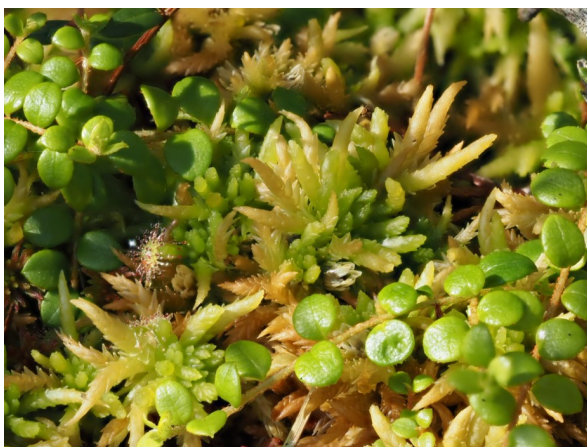
Sphagnum centrale Gaultheria hispidula