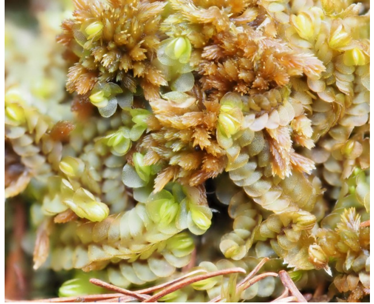
Sphagnum fuscum Mylia anomala

These student-led projects and others like them provide invaluable data and lead to a deeper understanding of our beloved natural areas, and through the students, help to build better connections with our human and non-human communities.