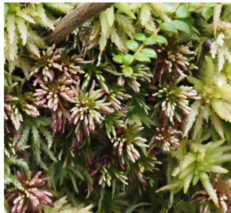
Sphagnum russowii Sph centrale