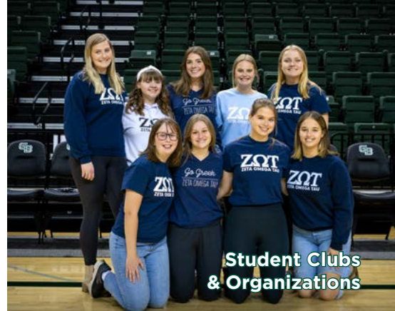
Student Clubs & Organizations