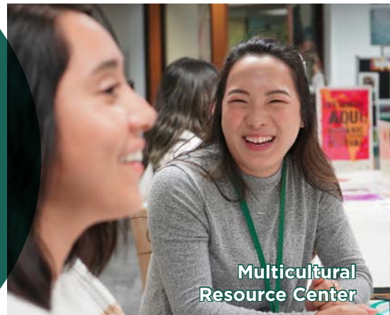
Multicultural Resource Center