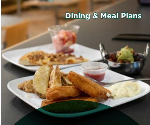
Dining & Meal Plans