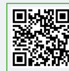
UW-Green Bay Campus Calendar