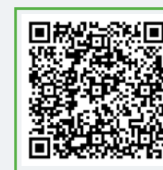
Spring 2025 Registration Calendar